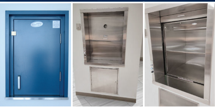
Swing landing door